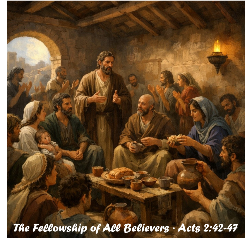
The Fellowship of All Believers · Acts 2:42-47

petersburgchurch.com · umcpetersburgoffice@gmail.com